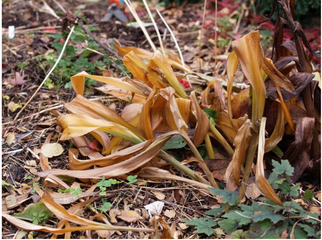
Roscoea humeana leaves

I use the same methods with many other plants such as Roscoea humeana which also have tender shoots and fat storage roots that would provide an easy meal for slugs during the winter if you do not close off the gaps in the soil left by the stems as they die off.