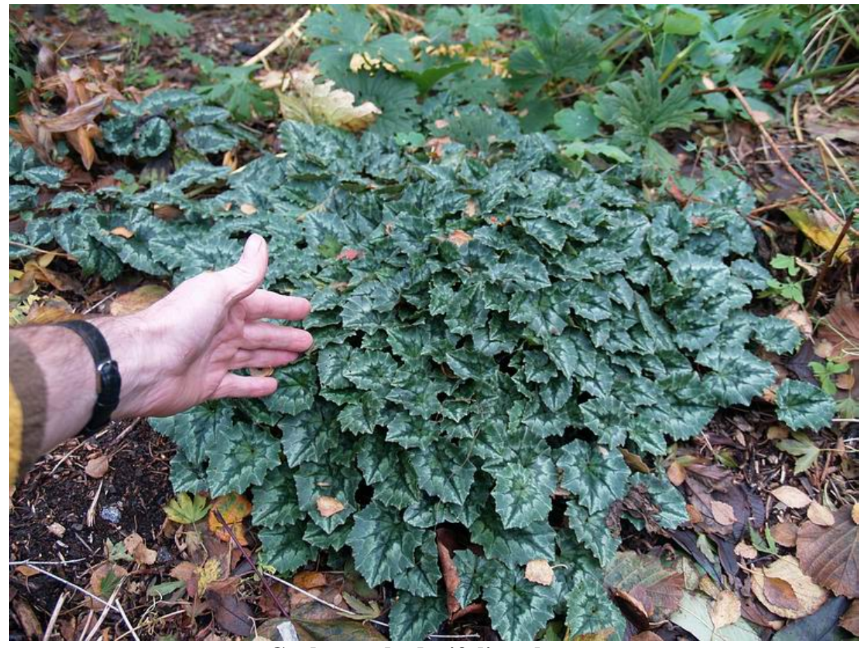
Cyclamen hederifolium leaves

Most of the Cyclamen hederifolium flowers are now past but the leaves will remain an attractive feature in the garden all through the winter and it will be next summer before they eventually die back. Sometimes in our cool conditions they would remain green all year round and I have to remove them in the summer before next years flower start appearing