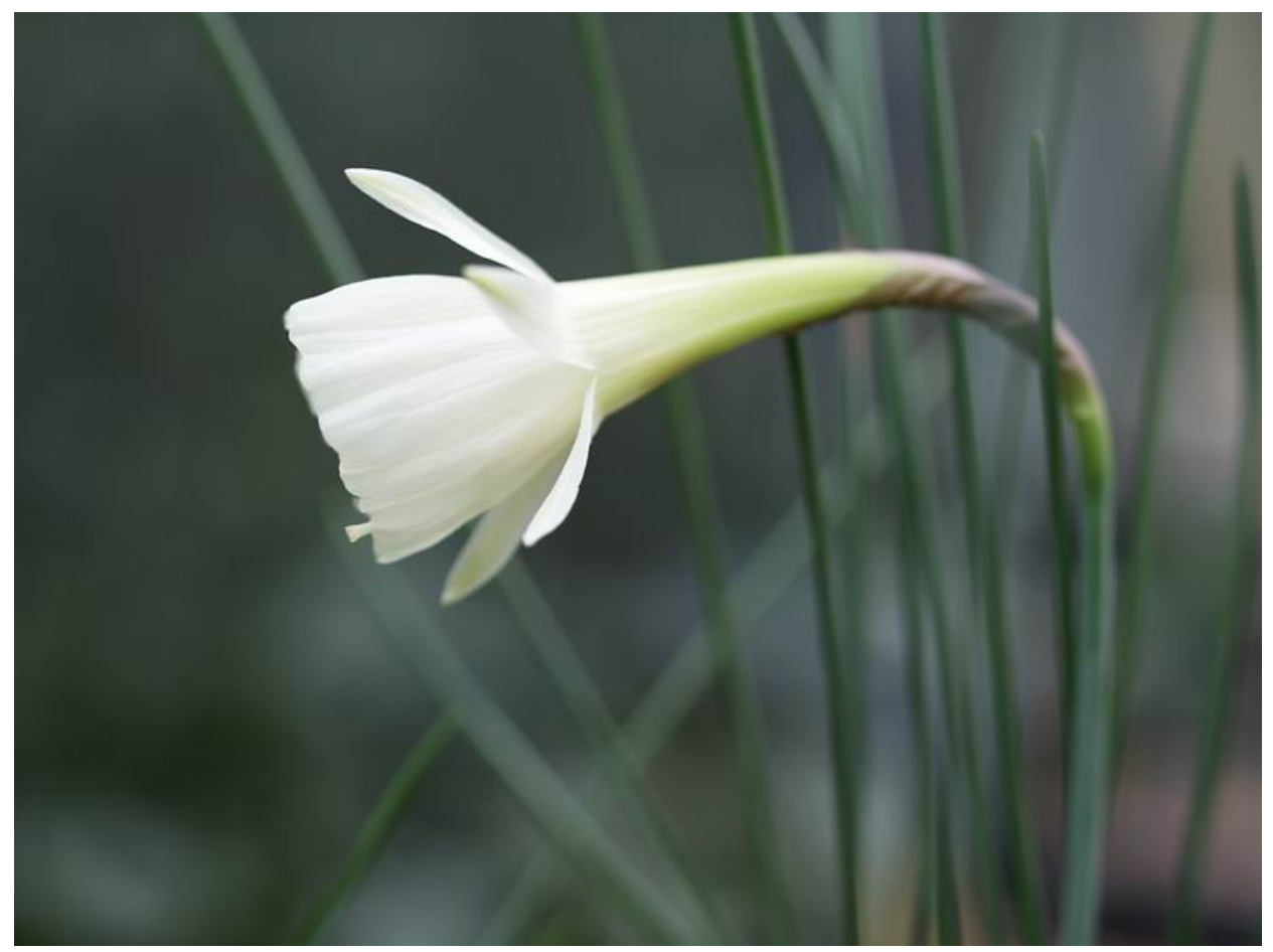
Narcissus cantabricus foliosus

Narcissus cantabricus foliosus is always the first of the winter flowering species to open its flowers in the bulb house. This is the start of the long succession of Narcissus flowers we should be able to enjoy all through the winter. Unfortunately the flower stems will etiolate in the very poor light levels we have through the winter and this is not going to be helped by the dark days we are currently experiencing.