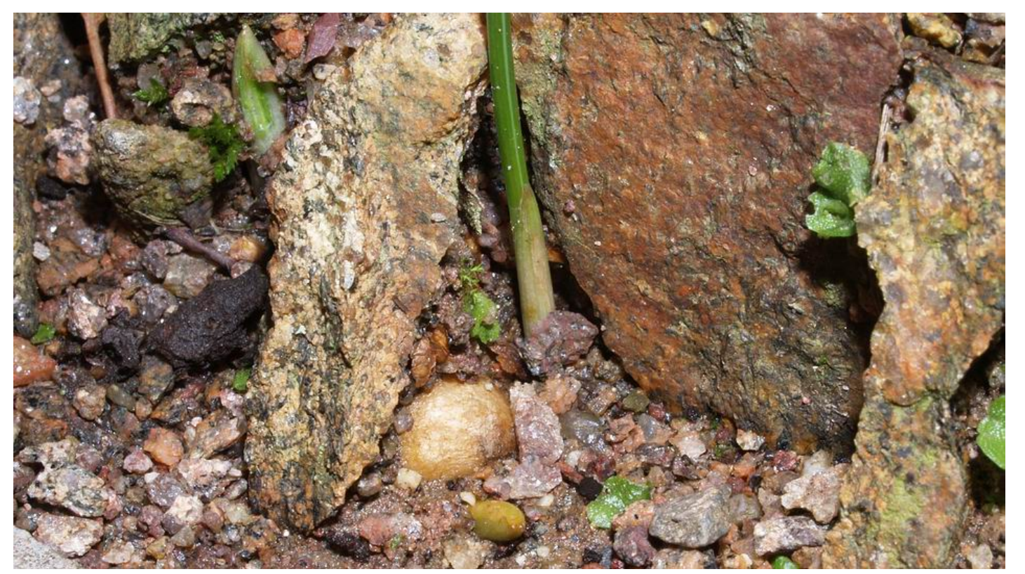
Shoot and tuber

It is not the only Crocus laevigatus that has appeared this way and this is one that I have rogued previously from another pot and planted out in the small sand bed that I constructed about three years ago where I place all my stray unidentified bulbs at repotting time.