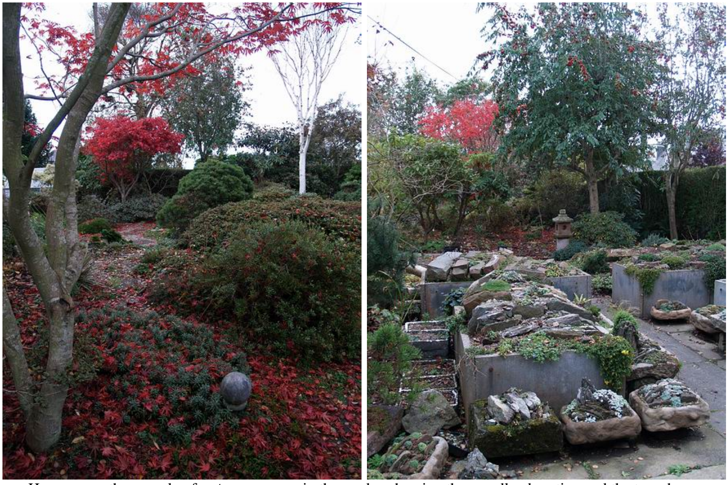
Here are another couple of autumn scenes in the garden showing the woodland section and the trough area.

I use the same methods with many other plants such as Roscoea humeana which also have tender shoots and fat storage roots that would provide an easy meal for slugs during the winter if you do not close off the gaps in the soil left by the stems as they die off.