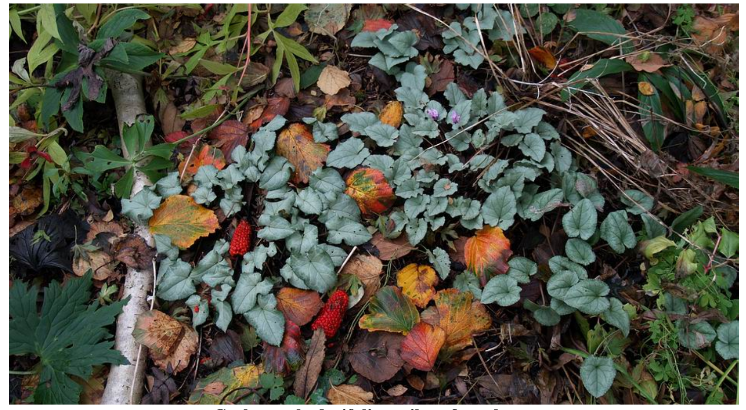
Cyclamen hederifolium silver form leaves

Most of the Cyclamen hederifolium flowers are now past but the leaves will remain an attractive feature in the garden all through the winter and it will be next summer before they eventually die back. Sometimes in our cool conditions they would remain green all year round and I have to remove them in the summer before next years flower start appearing